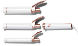
T3 TWIRL TRIO