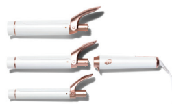
T3 TWIRL TRIO